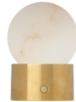
Alabaster and Hand Rubbed Antique Brass

Includes 120-240V 2.2 watts, 234 delivered lumens, 90 CRI 2700K LED module. Built-in three way dimming. Hand Rubbed Antique Brass includes cream cable. 6 feet of USB C to C cable. Wall charger included.