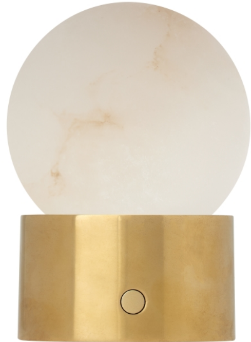
Alabaster and Hand Rubbed Antique Brass