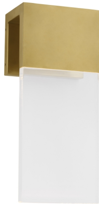
Natural Bras Alt (Lit)