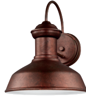
FREDRICKSBURG Satin Aluminum [-04] Weathered Copper [-44]