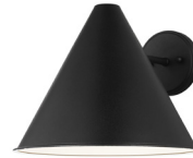
CRITTENDEN Black [-12] Satin Aluminum [-04]