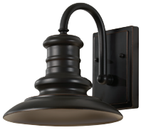
REDDING STATION Restoration Bronze [RSZ] Tarnished Silver [TRD] Textured Black [TXB]

Generation Lighting offers dark sky-friendly fixtures in multiple styles and finishes to suit a variety of outdoor applications.