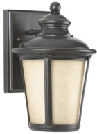
CAPE MAY Burled Iron [-780]