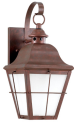
CHATHAM Weathered Copper [-44]