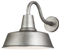
BARN LIGHT Antique Bronze [-71] Black [-12] Weathered Pewter [-57]