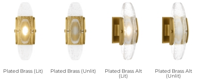
Plated Brass Alt (Lit)

To view all available finish options, please visit techlighting.com