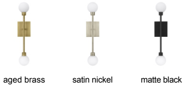
aged brass satin nickel matte black