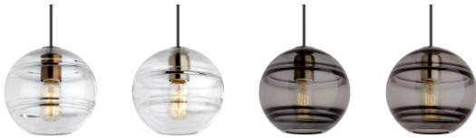
clear / aged brass