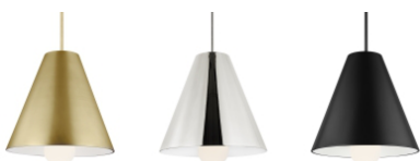
brass (aged brass not shown)