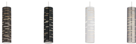
antique bronze gloss black gloss white satin nickel