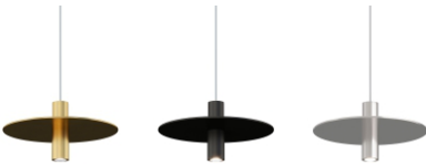
natural brass nightshade black satin nickel