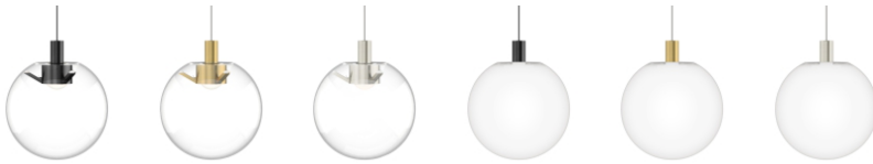
clear / matte black clear / natural brass clear / satin nickel white / matte black white / natural brass white / satin nickel