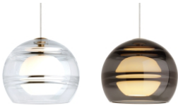
clear / aged brass