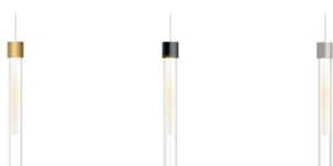
natural brass nightshade black satin nickel