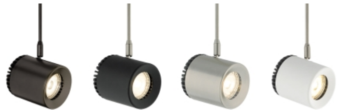
Antique Bronze / Antique Bronze