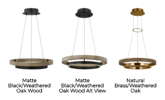
Matte Black/Weathered Oak Wood

module. Dimmable with most LED compatible ELV and TRIAC dimmers. Ships with 12 feet of field-cuttable cable.