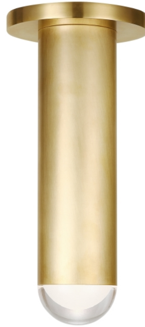
Natural Brass (Lit)