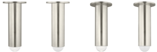
Antique Nickel (Lit) Antique Nickel (Unlit) Antique Nickel (Alt Lit) Antique Nickel (Alt Unlit)

Includes 120V-277V 10.5 watts, 620 delivered lumens, 90 CRI 2700K LED module. Dimmable with most LED compatible ELV, TRIAC and 0-10V dimmers. Ceiling mount only.