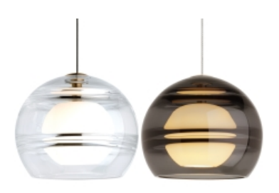
Clear / Aged Brass