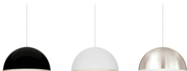
high gloss black / high gloss white / satin nickel / white white white