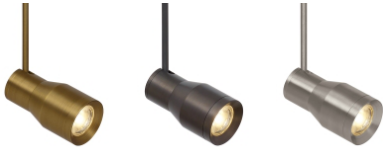
aged brass antique bronze satin nickel