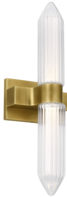
Brass (Alt Lit)