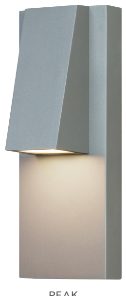
PEAK shown in silver