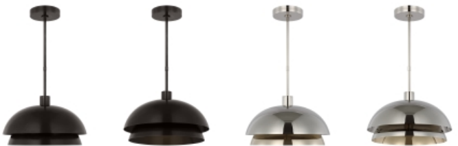
Dark Bronze Dark Bronze Alt View Polished Nickel Polished Nickel Alt View

To view all available finish options, please visit techlighting.com