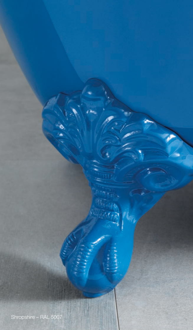
Shropshire – RAL 5007