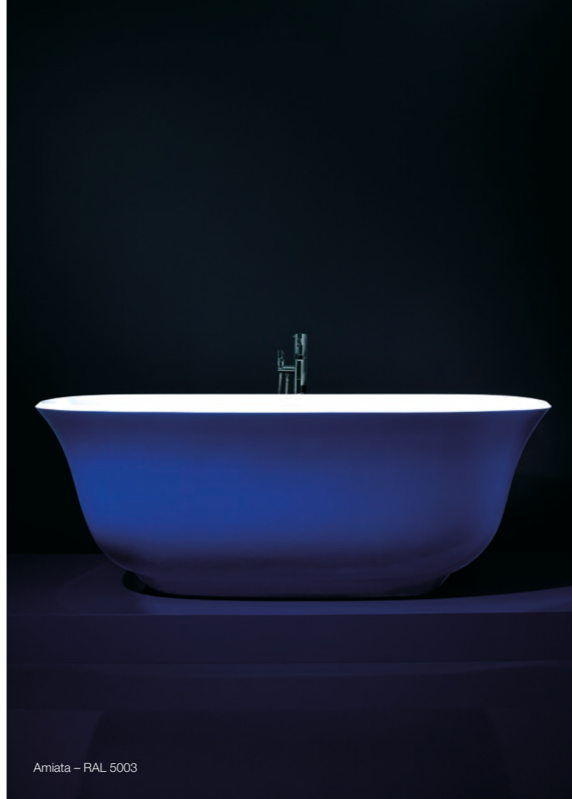
Amiata – RAL 5003