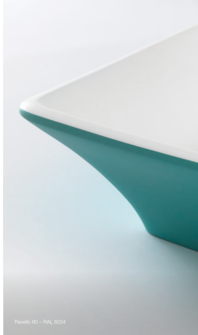
Ravello 60 – RAL 6034