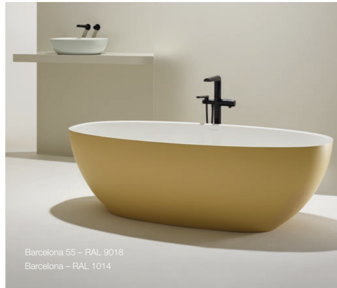
Barcelona 55 – RAL 9018 Barcelona – RAL 1014

DUNE RETREAT IS INSPIRED BY SHIFTING SANDS OF THE DESERT AND EARTH'S NATURAL MINERALS