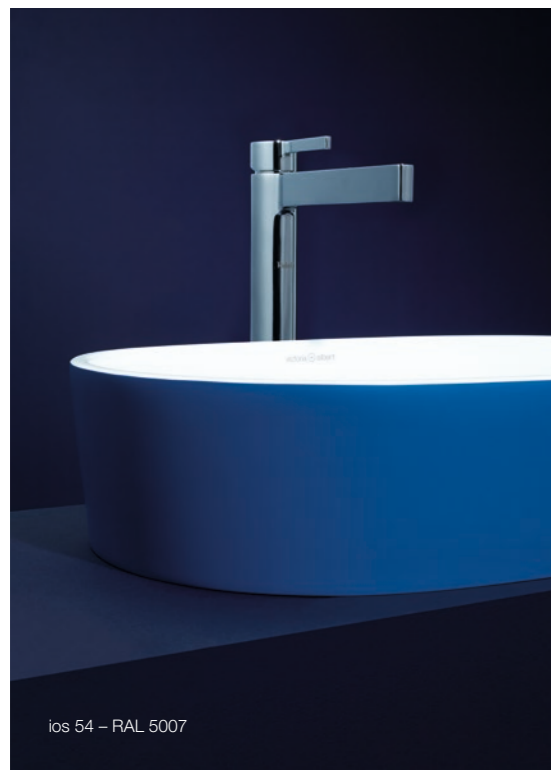
ios 54 – RAL 5007

WAVELENGTHS EVOKES SENTIMENTS OF CALMNESS AND WELLBEING INSPIRED BY THE FLUIDITY OF WATER