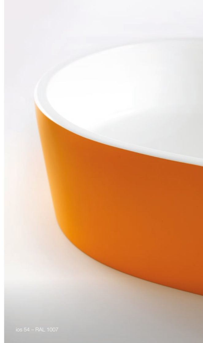
ios 54 – RAL 1007