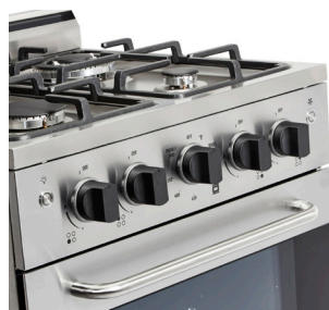
Modern knobs designed for cooktop & oven