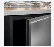
Stainless Handleless Panel