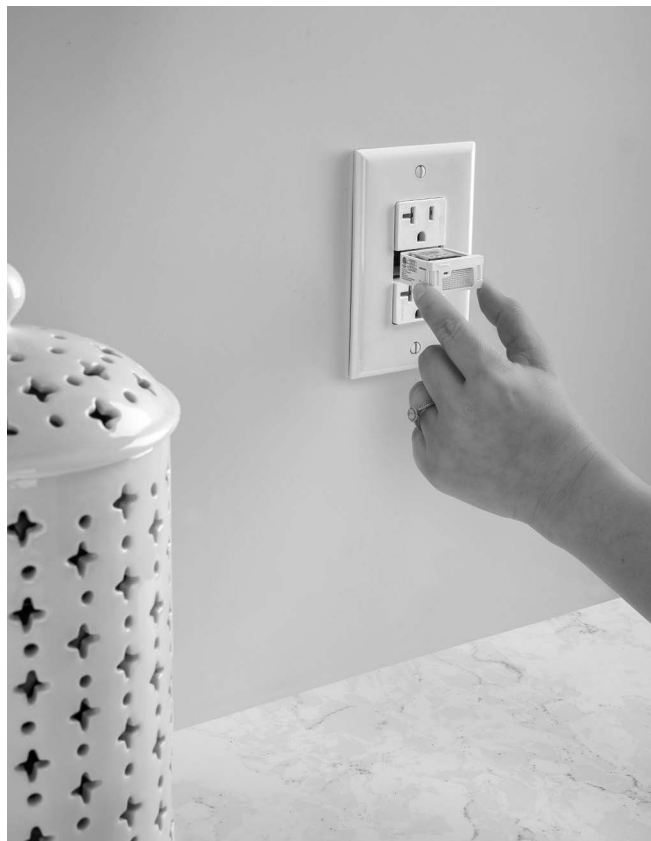
20A Outlet with Wi-Fi Control + Guide Light Insert (sold separately)

Save these instructions for future reference.