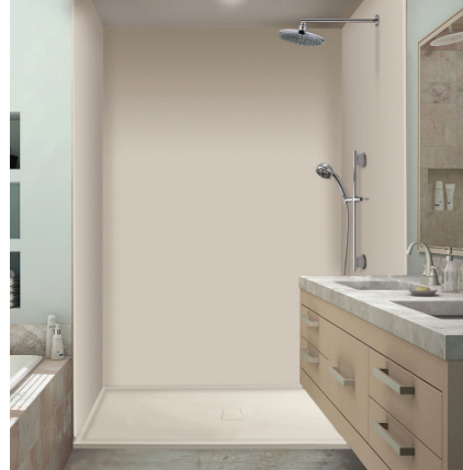
Modern low profile design with a slate look slip resistant texture.