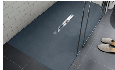
Modern drain design for 32C and 36C Widths

Notes: Install this product according to the installation instructions.