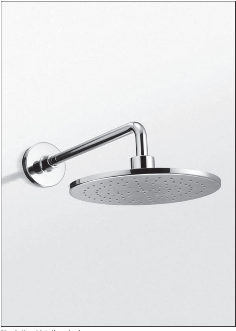
TS100B#CP - 11" Rain Showerhead