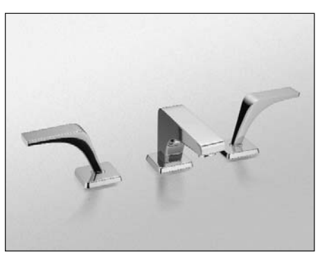
TL680DD - Ethos™ Design C lavatory faucet