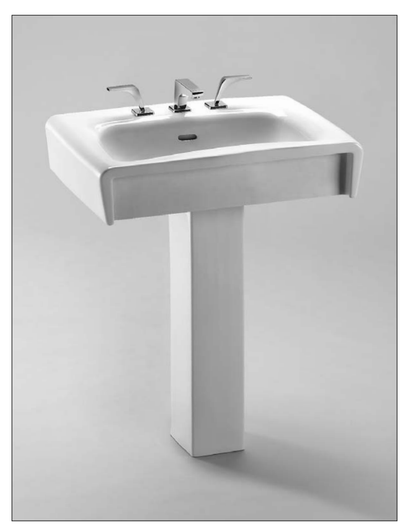
LPT680.8G - Ethos™ Design C Pedestal Lavatory