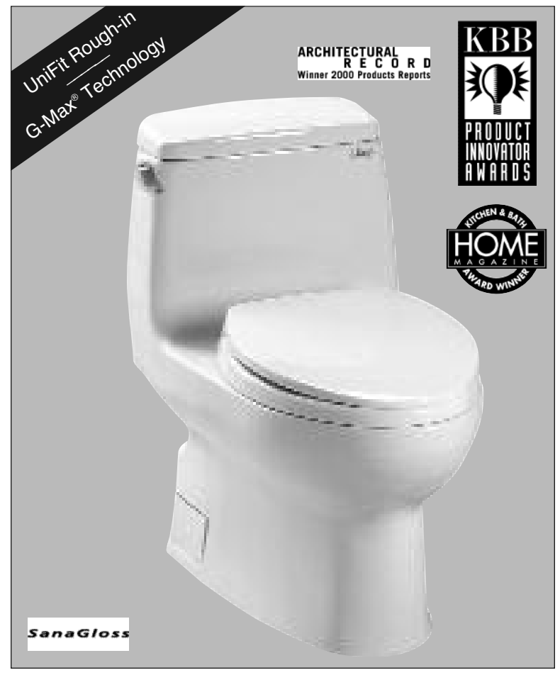
MS874114SG - Carlyle Toilet with SanaGloss and SoftClose Seat