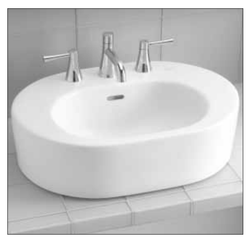
LT791.8 - Nexus™ Vessel Lavatory