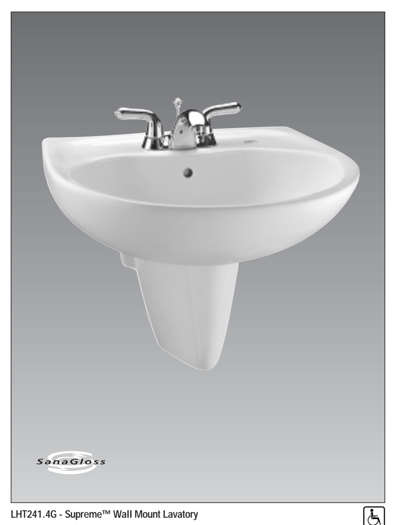
LHT241.4G - Supreme<sup>™</sup> Wall Mount Lavatory