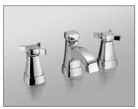
TL670DD - Ethos™ Design NI lavatory faucet