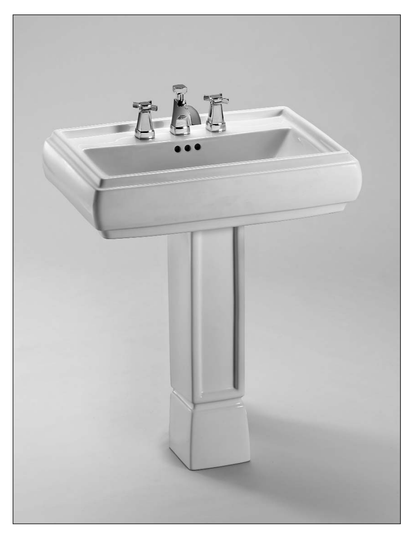
LPT670.8G - Ethos™ Design NI Pedestal Lavatory