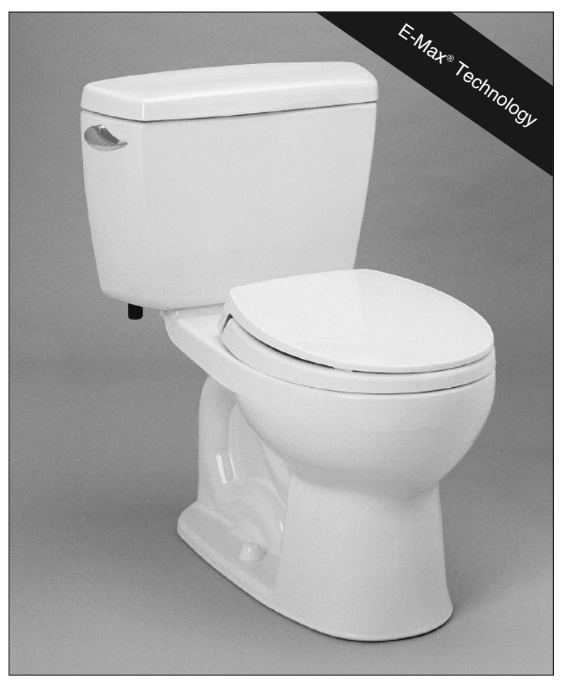
CST743E - Eco Drake® Close Coupled Toilet with SS113 - SoftClose Seat