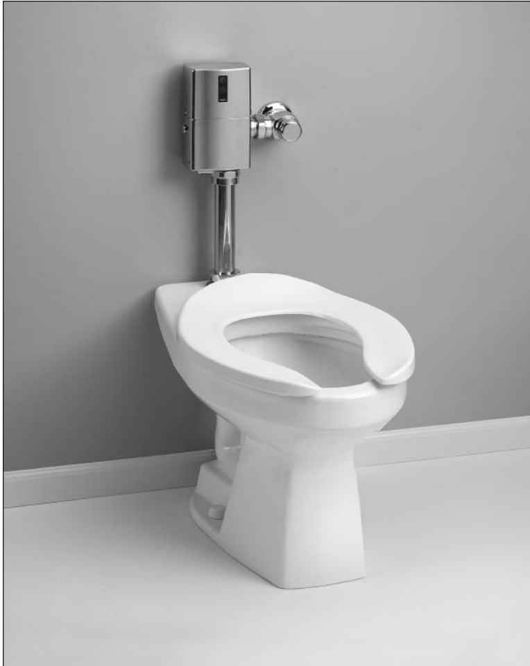
CT705E - Flushometer Toilet SC534 - Commercial Toilet Seat TET1LN32#CP - 1.28GPF ECO EFV - Automatic Flushometer Valve