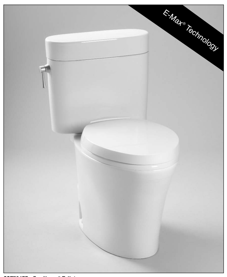
CST794EF - Eco Nexus® Toilet SS204 - SoftClose® Oval Seat