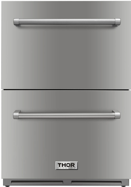
Product: 24 Inch Indoor Outdoor Refrigerator Drawers