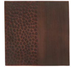
Custom Antique Copper