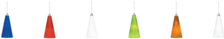
blue-violet ferrari red frost white lime green tahoe pine amber white frit