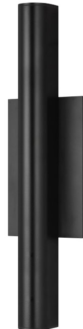
CHARA 17 WALL shown in black

* Visit techlighting.com for specific warranty limitations and details.