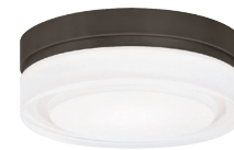
CIRQUE SMALL shown in bronze