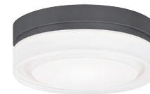
CIRQUE SMALL shown in charcoal