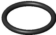
002721-45 O-Ring (Qty 2)