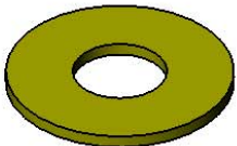
001042-45 Custom Bonnet Washer (Qty 2)