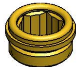
000764-20 Seat (Qty 2)

Product Specifications: B-0290-K Parts Kit for Big-Flo Faucets