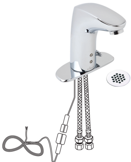
Ultra-Sense AC Powered Faucet (for use in multi-unit installations) S-6080-ACM-12V-G: with grid drain assembly S-6080-ACM-12V: faucet only