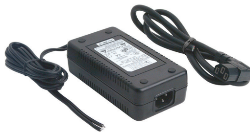
Ultra-Sense Power Supply S-6240-12V: multi-unit power supply 120 VAC/12 VDC, 60Hz (for use with up to eight (8) S-6080-ACM-12V faucets only)