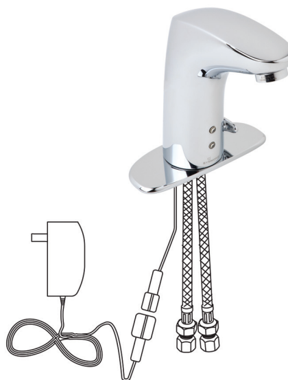
Ultra-Sense AC Powered Faucet S-6080-AC-12V-G: with grid drain assembly S-6080-AC-12V: faucet only