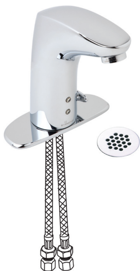
Ultra-Sense Battery Powered Faucet S-6080-G: with grid drain assembly S-6080: faucet only

Symmons legendary S-6080 Ultra-Sense Sensor Faucet has become the first choice for countless contractors, engineers and architects across the country since it was first introduced over a decade ago.