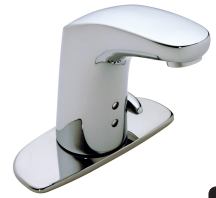
Model S-6080 with 4 inch deck plate