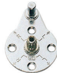
Mounting Plate SDS-A