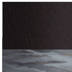
Black Tie with Silver Metallic Lining