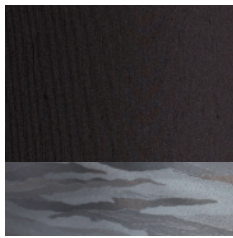
Black Tie with Silver Metallic Lining