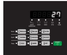
FV6 Control Panel

Engineered and built like no other, the Speed Queen® coin drop front load washer and dryer are designed for performance and reliability. Our commercial-grade construction is rugged, dependable, and built to last. Plus, property owners can rely on the practical ingenuity of features designed to make their lives simpler and more productive.