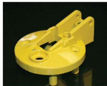
ULTRALATCH DRILL GUIDE, PART # LDG

The UltraLatch requires a precisely located screw hole drilled perpendicular to the door face above the face hole. This is why we highly recommend the purchase of the optional UltraLatch drill guide to ensure the proper location of this hole.