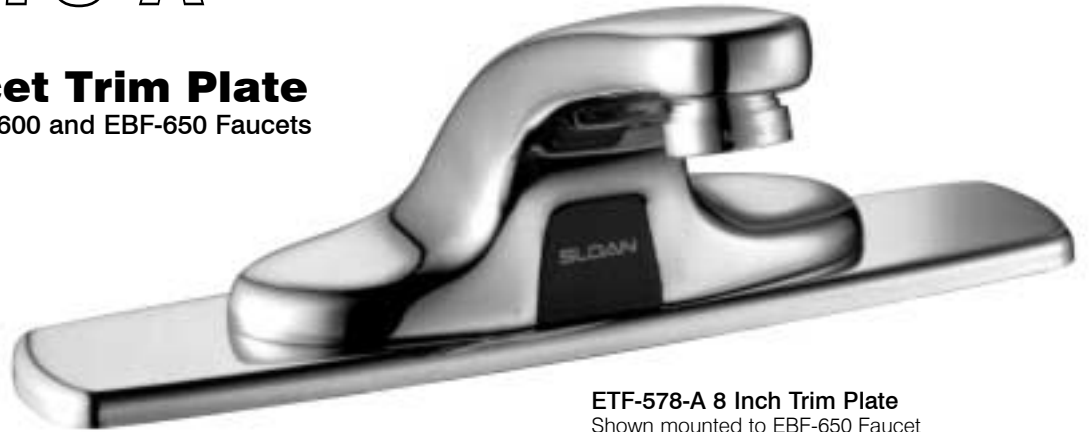
ETF-578-A 8 Inch Trim Plate Shown mounted to EBF-650 Faucet

For Sloan Model ETF-600 and EBF-650 Faucets