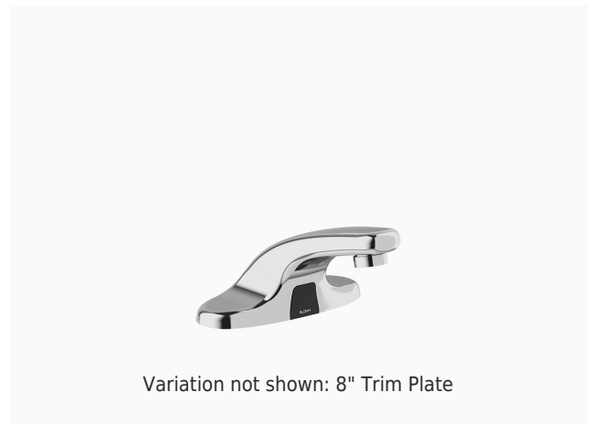
Variation not shown: 8" Trim Plate